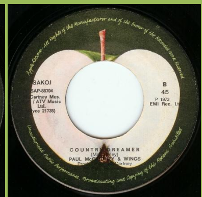
1973 in small print