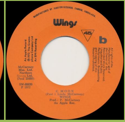
Spacing over SW-88639 number

APPLE/JUGOTON SAP-88669 - MY LOVE / THE MESS