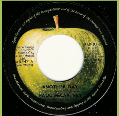
Without print Joint interest claimed by McCartney Music