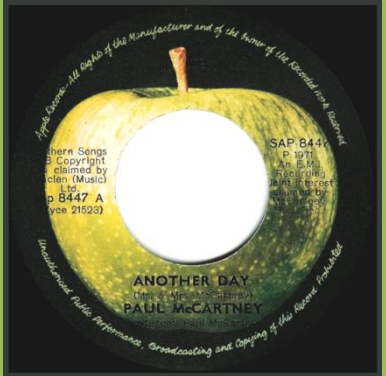
Without print Joint interest claimed by McCartney Music Inc.