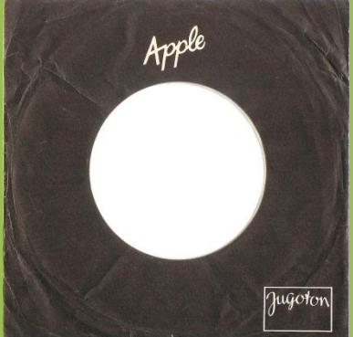
Type 2, thumb tab on rear