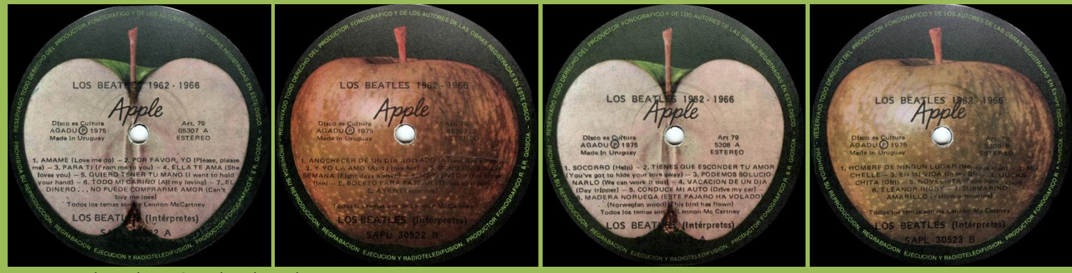
Large Apple, sides 1 & 3 sliced Apple