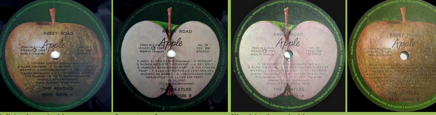
Full Apple on A-side