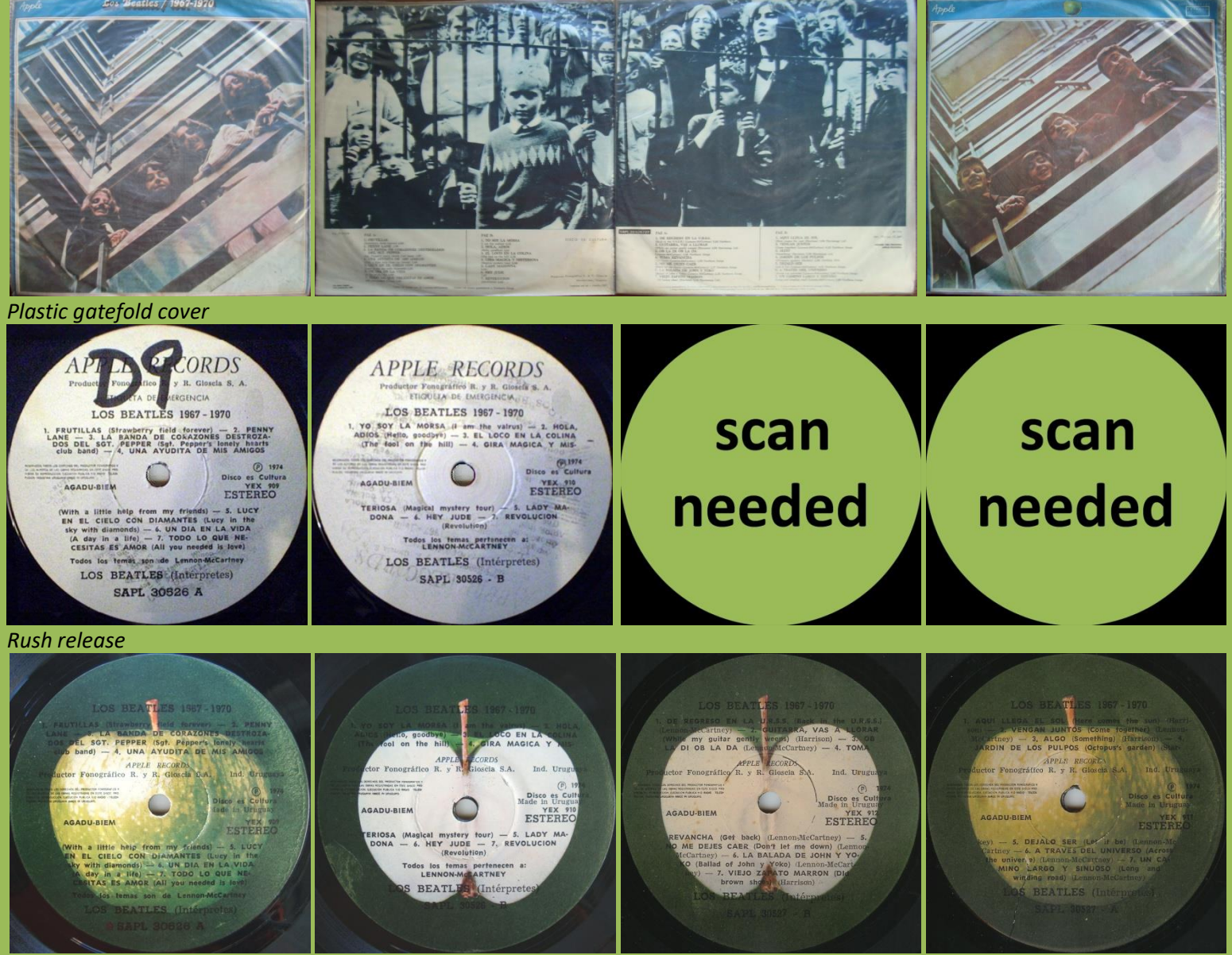
Made In Uruguay print under Disco es Cultura