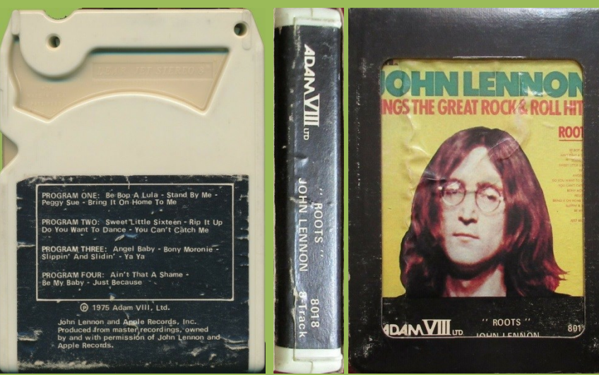
Apple Records print on rear label