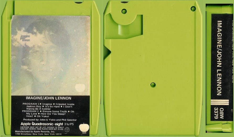
Green shell, "tapered" shell, held together by clips