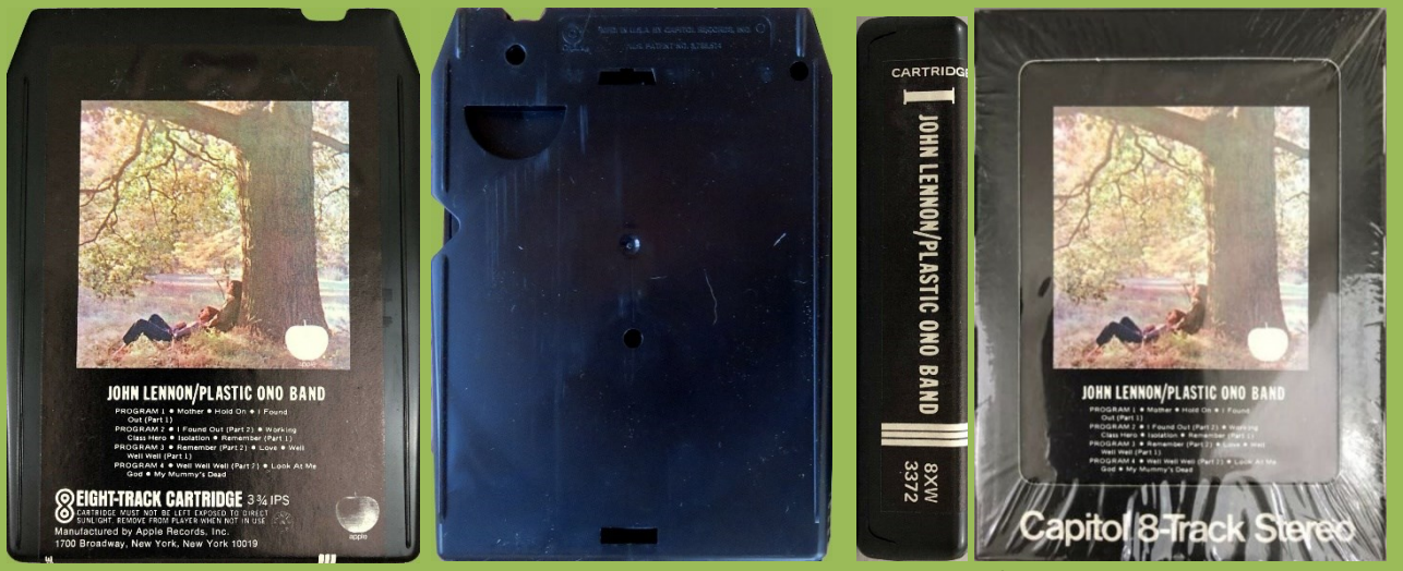
First withdrawn issue to be sold as a 2-cartridge set together with Yoko Ono/Plastic Ono Band, generic Capitol cardboard box