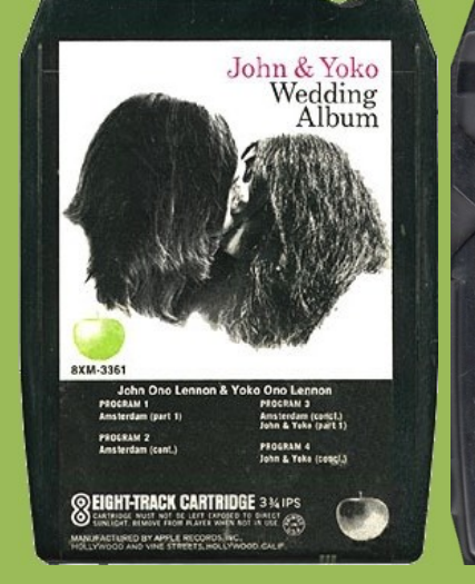
All inserts have the LP release number, 8-track release number only on box spine and cartridge