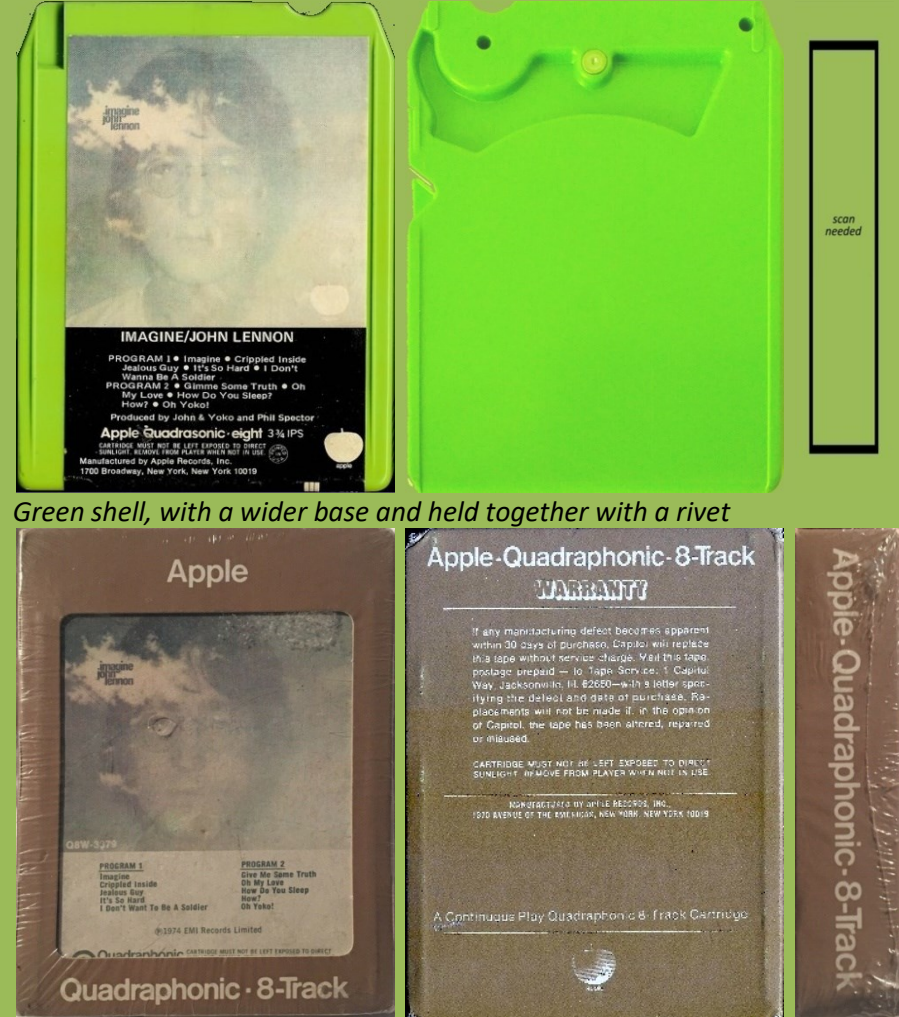
Special Apple Quadraphonic-8-Track box, later issue