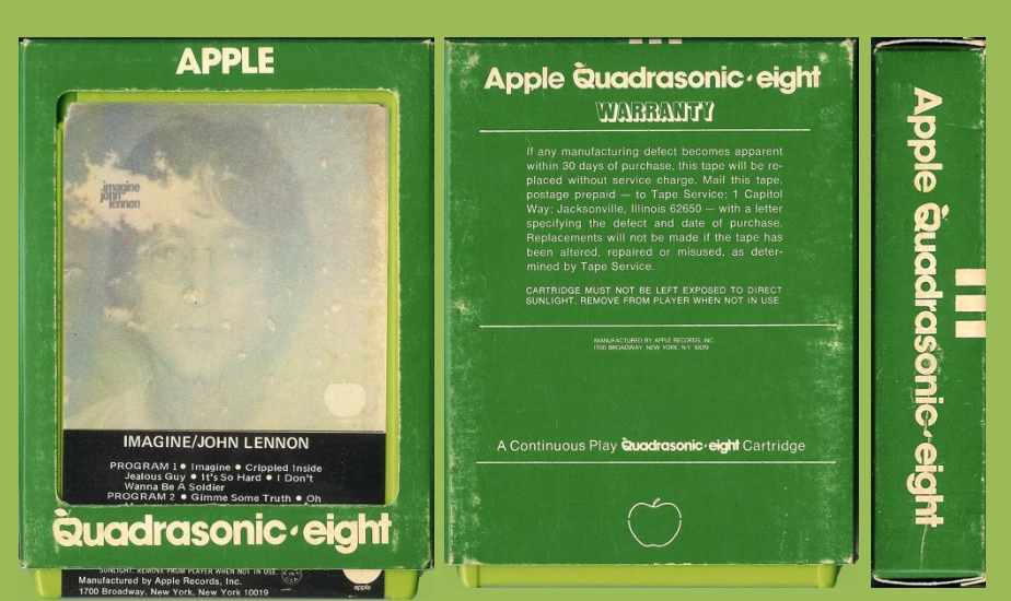
Unique green Apple Quadrasonic-eight box