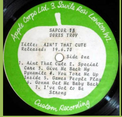
Aint That Cute without apostrophe