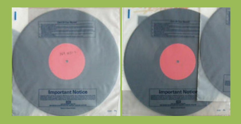
APPLE PCS 7168 - GOODNIGHT VIENNA (Ringo Starr)