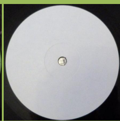
APPLE SAPCOR 21 - EARTH SONG OCEAN SONG (Mary Hopkin)