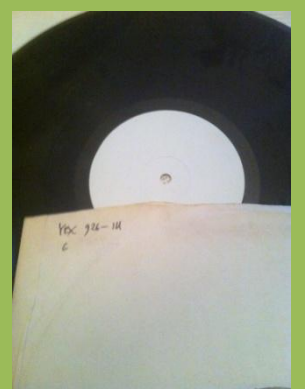
Contains long version of Six O'Clock