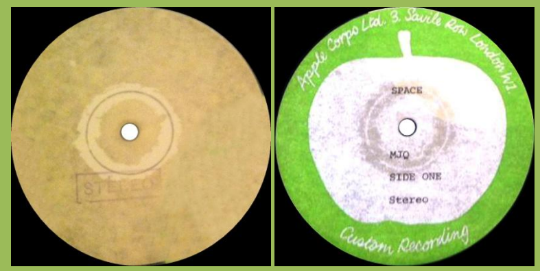
Apple custom label glued onto blank label with Stereo print