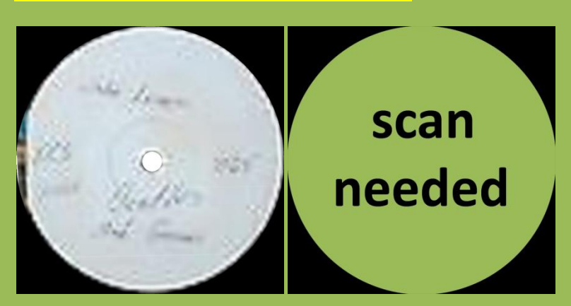
ZAPPLE 01 - UNFINISHED MUSIC No. 2: LIFE WITH THE LIONS (John Lennon/Yoko Ono)