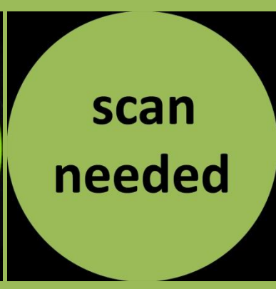
APPLE PCS 7124 - JOHN LENNON/PLASTIC ONO BAND (John Lennon/Plastic Ono Band)