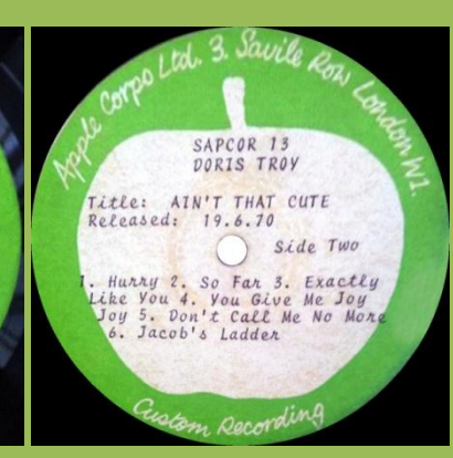
Ain't That Cute with apostrophe