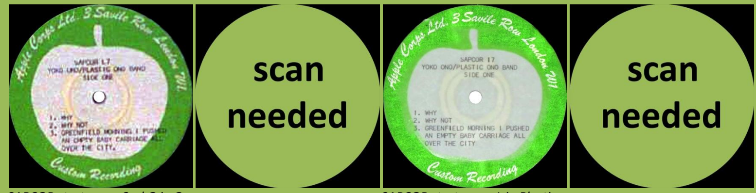
SAPCOR starts over 2nd O in Ono