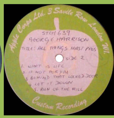
A-side label has come unstuck