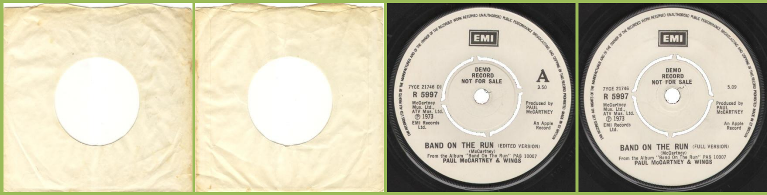
Demo, with An Apple Record print

APPLE R 5997 - BAND ON THE RUN / ZOO GANG