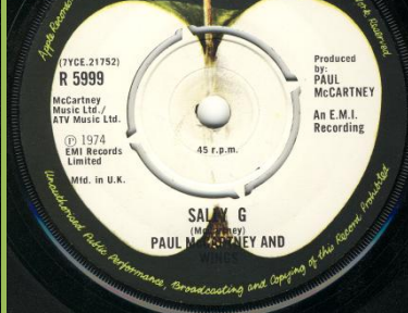
20 mm. polo ring