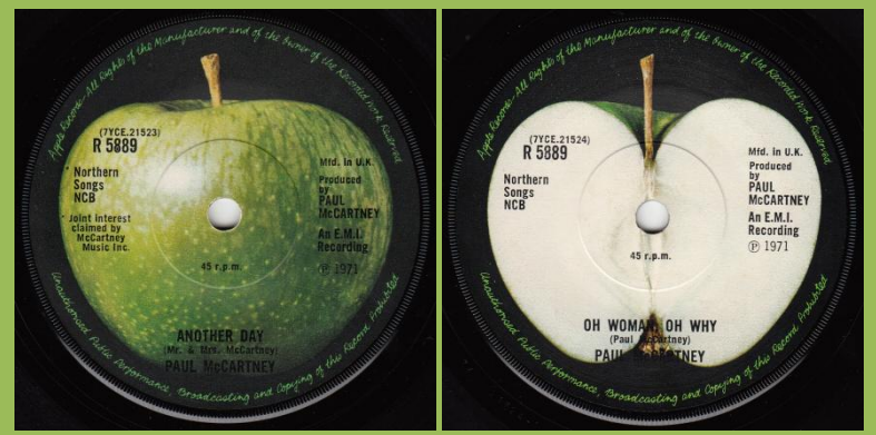
Solid center, 'claimed' starts under spacing between J & o in Joint