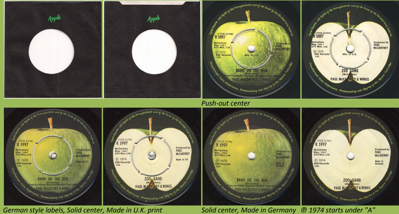
German style labels, Solid center, Made in U.K. print