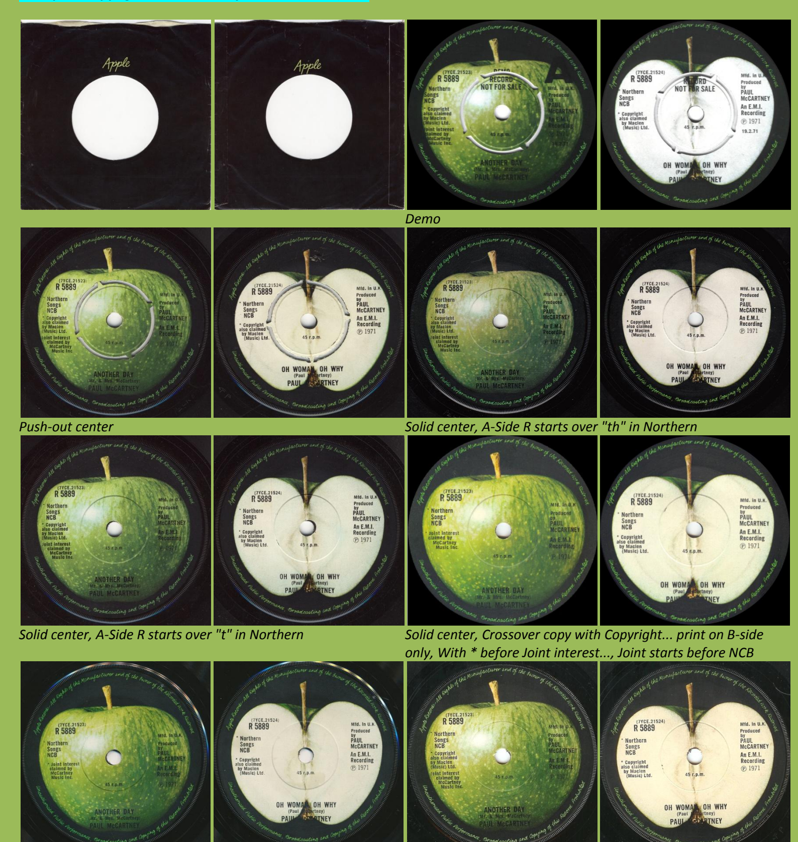
Solid center, Crossover copy with Copyright... print on B-side only, With * before Joint interest..., Joint starts under C in NCB