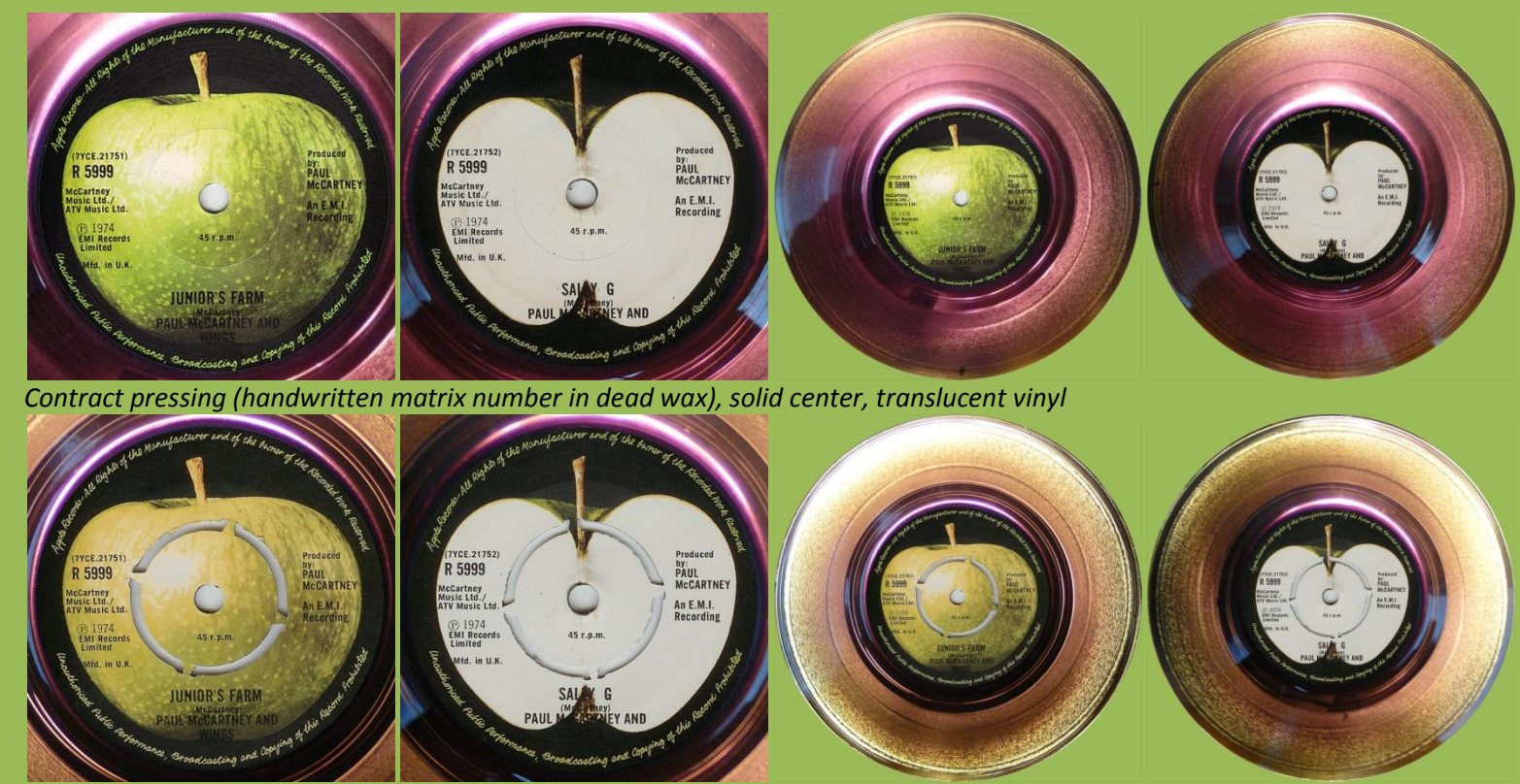
Contract pressing (handwritten matrix in dead wax), push-out center, translucent vinyl