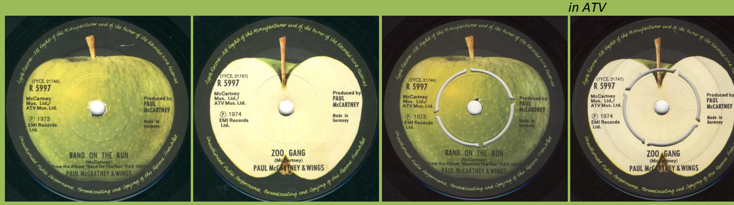
Solid center, Made in Germany @ 1974 starts under "V" in ATV