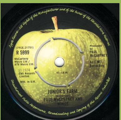
Push-out center, 15 mm. polo ring