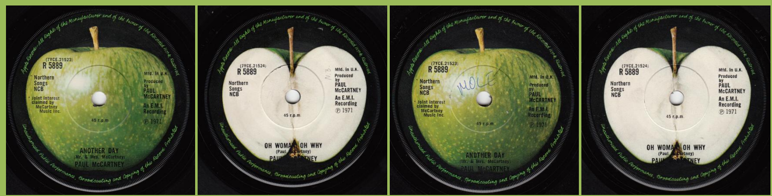
Solid center, 'claimed' starts under J in Joint