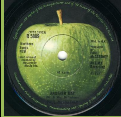
Solid center, McCartney starts under spacing between c & l in claimed