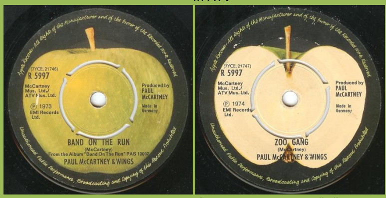
Solid center, Made in Germany, @ 1974 starts under "A" ℗ 1974 starts under "T" in ATV in ATV