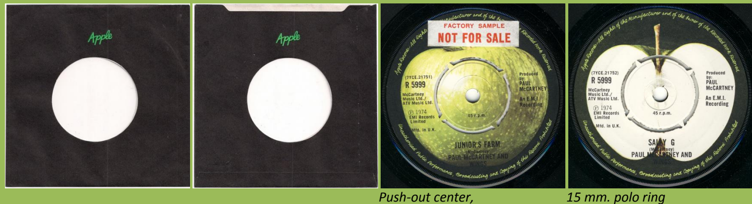
Push-out center, 20 mm. polo ring