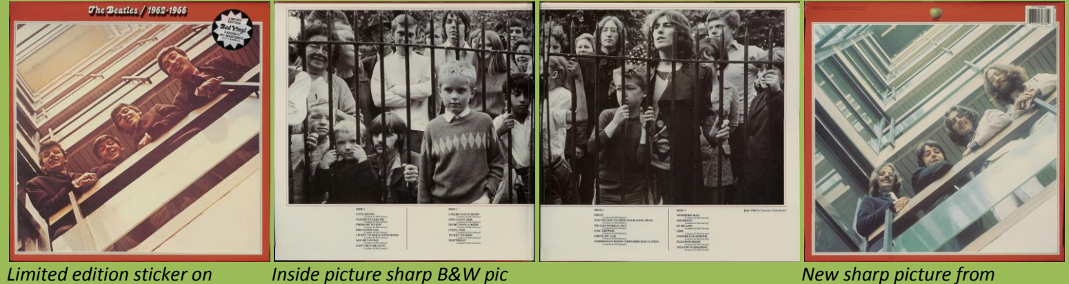
Limited edition sticker on frontcover