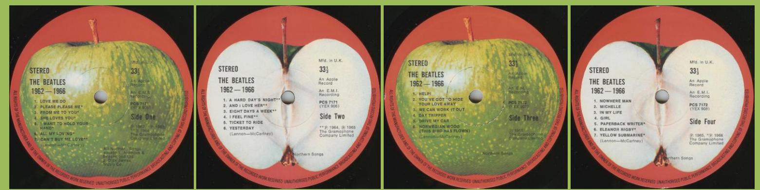
Matte label with slightly raised edge, Matrix YEX 905-1, 906-1, 907-3, 908-1 (machine stamped), cover type 1

Inner sleeves (Earliest copies are angled cut at the top only, from around 1974 they can be cut on the bottom too, sometimes only on one bottom corner, sometimes both, so all four corners. From around 1975 the cut is rounded and after 1980 they are totally square.)