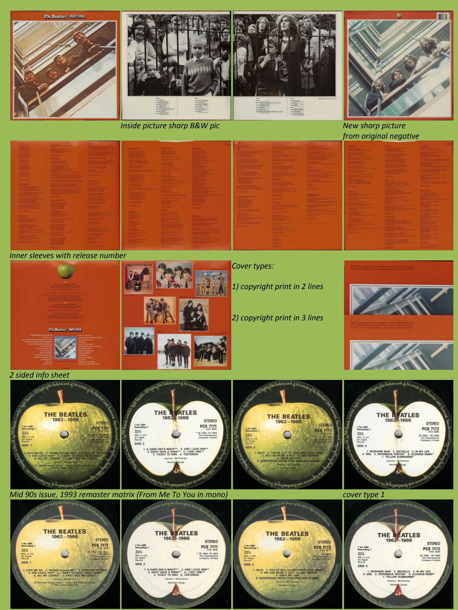
Early 2000 issue, Dutch contract pressing, dish label, 1993 remaster matrix (From Me To You in mono)