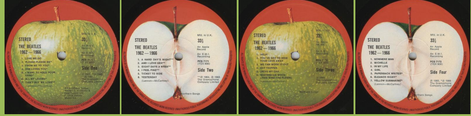
Glossy label with raised edges, Matrix YEX 905-1, 906-1, 907-2, 908-1 (machine stamped), cover type 3 contract pressing, no EMI