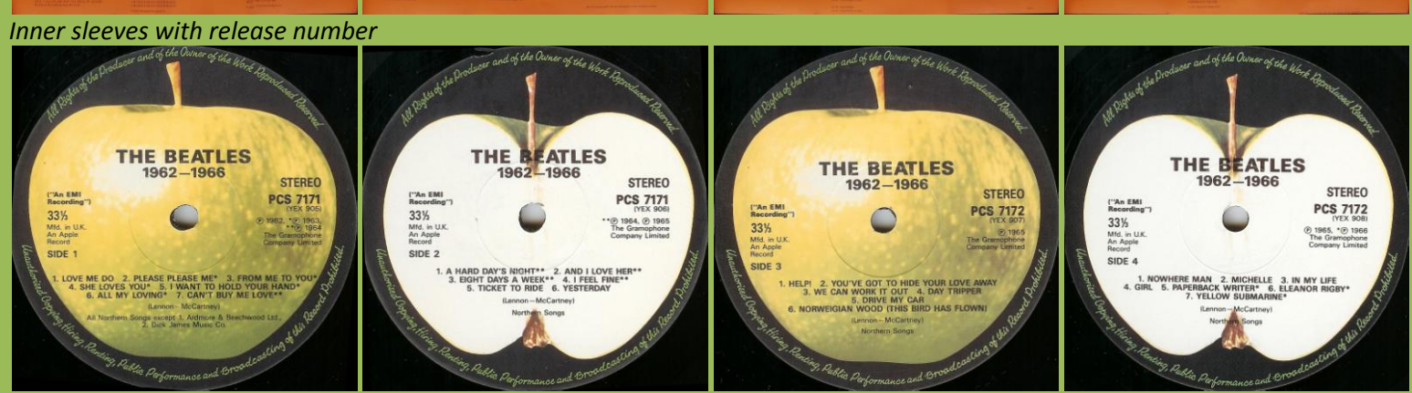
YEX UK-matrix from analogue master (From Me To You in stereo)