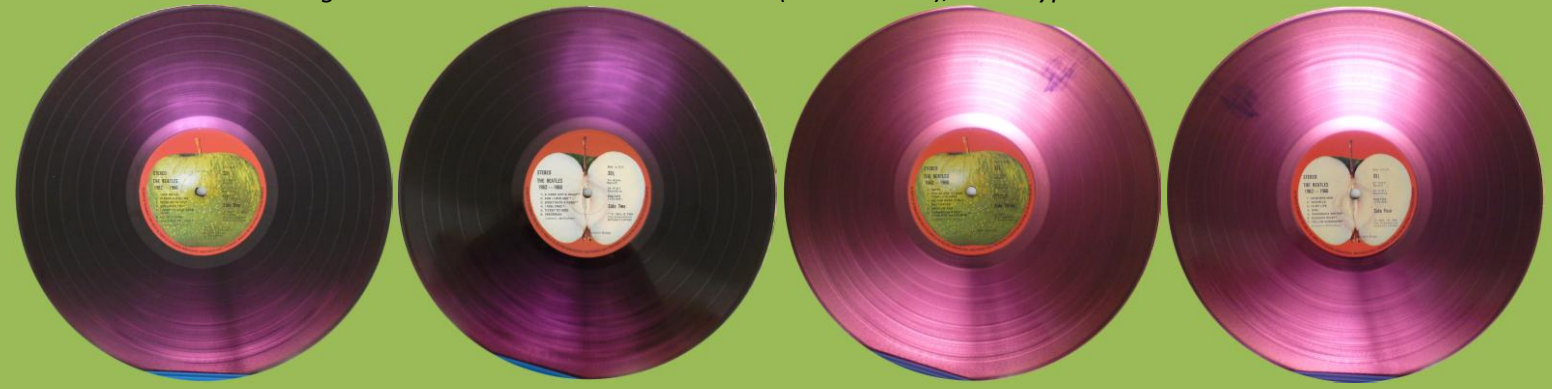
Pye contract press disc viewed under heavy backlight