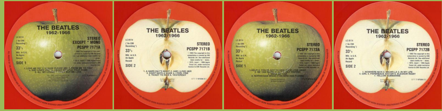
1993 remaster matrix (From Me To You in mono)