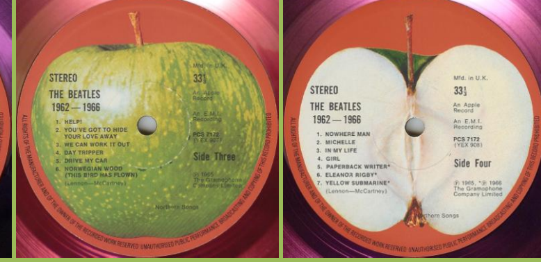
Matrix YEX 905-2, 906-2 (machine stamped), YEX 907-4, 908-2 (hand etched), cover type 1