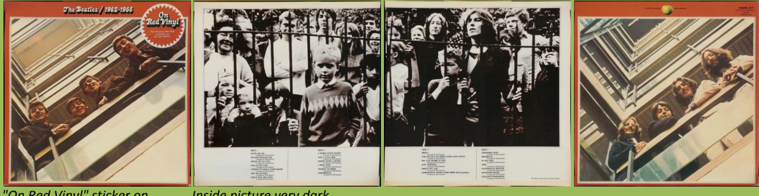
"On Red Vinyl" sticker on front cover