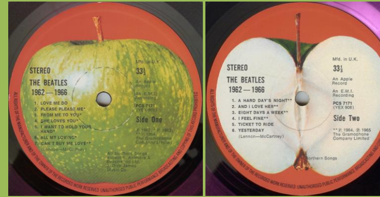
Pye contract press on translucent violet vinyl, matte label with raised edge