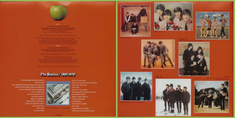
2 sided info sheet