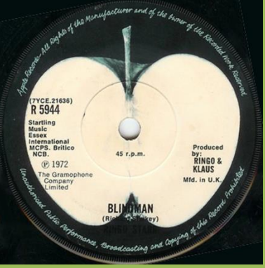
(7YCE starts before R, MCPS starts under spacing between I and n in