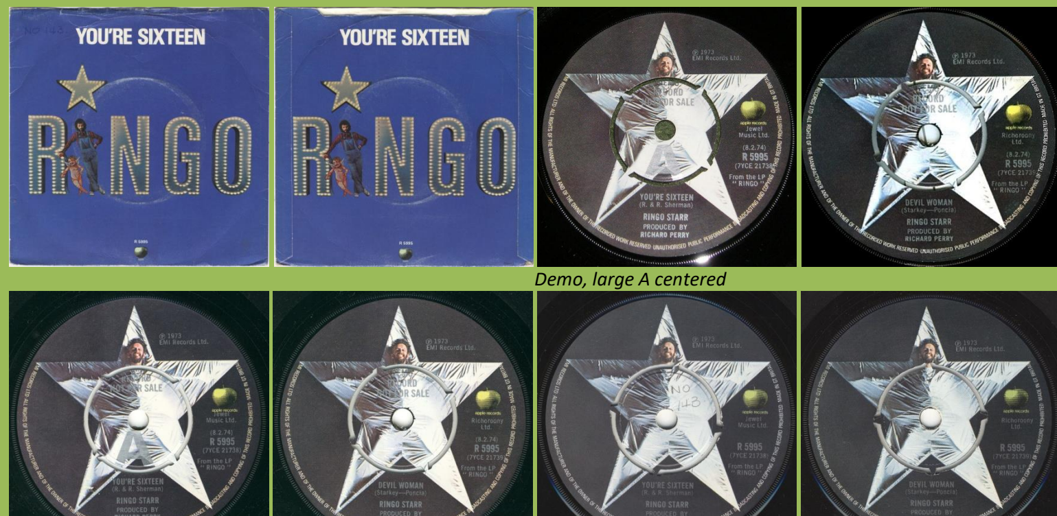
Demo, large A off-center

APPLE R 5995 - YOU'RE SIXTEEN / DEVIL WOMAN