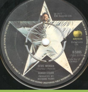
A in apple starts over spacing between i and c in Richoroony, R 5995 starts under i in Richoroony