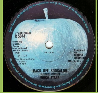
Mfd. in U.K. starts right of last O in BOOGALOO