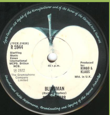
(7YCE) starts before R, NCB starts under spacing between C and P in MCPS, Produced by: Ringo & Klaus aligned

(7YCE) starts before R, NCB starts under spacing between C and P in MCPS, starts under N in NCB