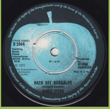
R 5944 starts under 7 in (7YCE, ® starts under spacing between N & C in NCB