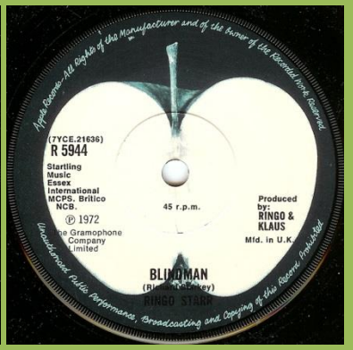
(7YCE) starts before R, NCB starts under C in MCPS, Produced by: Ringo & Klaus not aligned