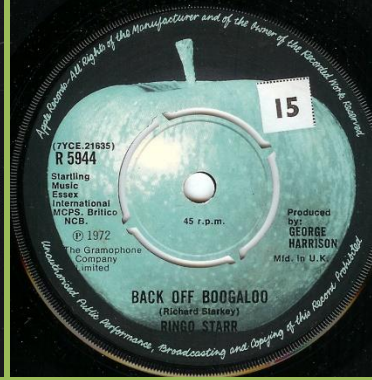
R 5944 starts under 7 in (7YCE, ® starts under spacing between C & B in NCB