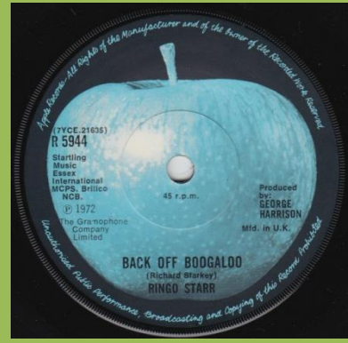
(7YCE starts over R, R 5944 and credits (more or less) aligned, @ starts under N in NCB

International, NCB starts under spacing between C and P, Produced by: Ringo & Klaus not aligned