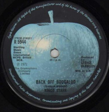
(7YCE) starts over R, NCB starts under P in MCPS, P starts under N in NCB