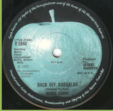
(7YCE) starts before R, NCB starts under spacing between C and P in MCPS.