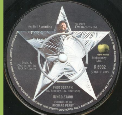
With Stereo on B-side only