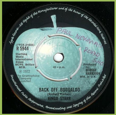
Crossover copy, dot after NCB on A-side, International Essex misprint

Push-out center (no dot after NCB, polo rings)