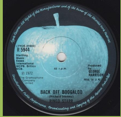
(7YCE) starts before R, NCB starts before M in MCPS, ® starts under . (dot) after NCB