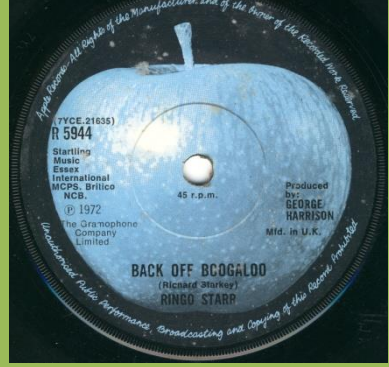
(7YCE starts over R, R 5944 and credits (more or less) aligned, @ starts under N in NCB