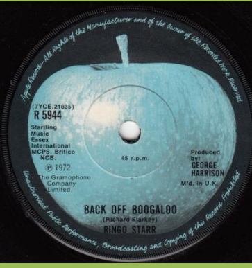
(7YCE starts before R, R starts over t in Startling, credits aligned, @ starts under C in NCB