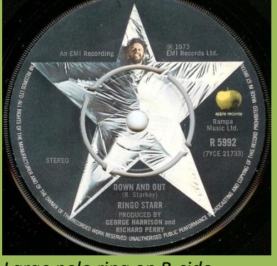
Large polo ring on B-side