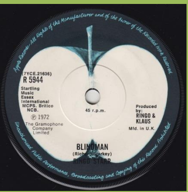
(7YCE starts before R, MCPS starts under spacing between I and n in International, NCB starts under spacing between C and P, Produced by: Ringo & Klaus aligned