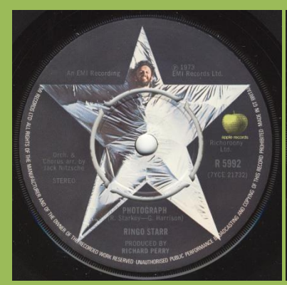
With Stereo on both sides