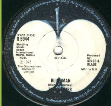
International & MCPS aligned