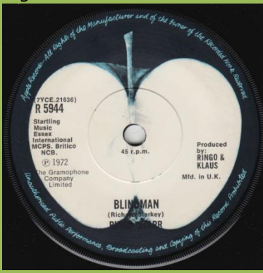
International & MCPS not aligned, NCB starts under P in MCPS