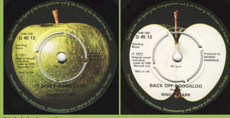
Dish label, push-out center