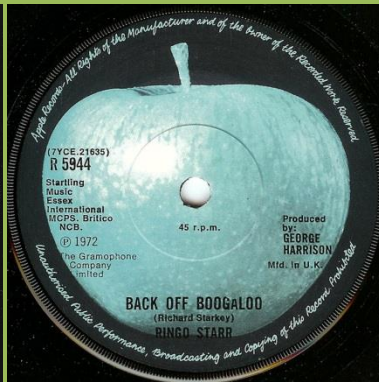
(7YCE) starts before R, NCB starts under C in MCPS, ® starts under spacing between N and C in NCB and over spacing between T & h in The