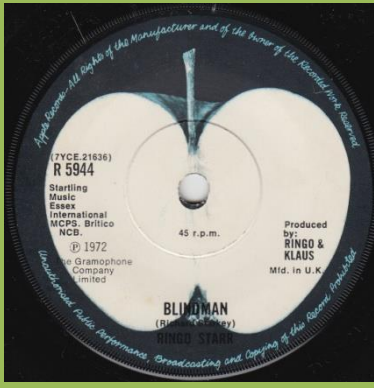
International & MCPS aligned, NCB starts under C in MCPS