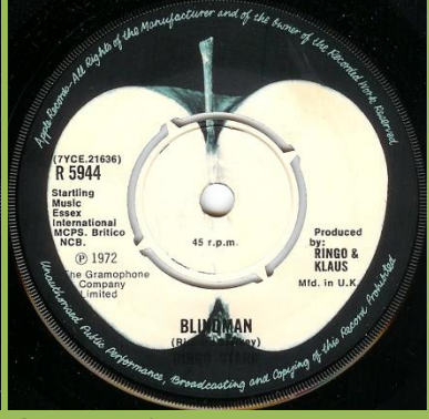
@ starts after B in NCB, P in Produced starts over y in by