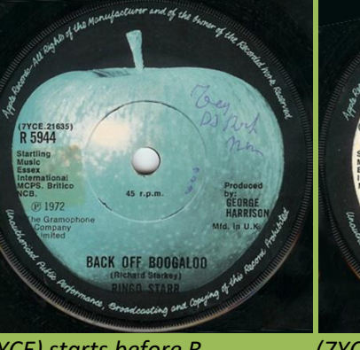
(7YCE) starts before R, NCB starts before M in MCPS, P starts under . (dot) after