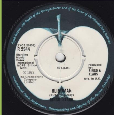
P starts under spacing between C & B in NCB