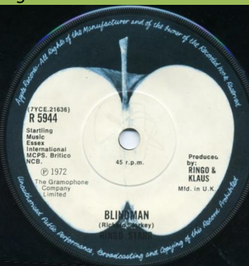
(7YCE) starts before R, NCB starts under M in MCPS, Produced by: Ringo & Klaus not aligned