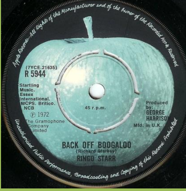
R 5944 starts under ( in (7YCE, @ starts under B in NCB, Mfd. in U.K. starts right of last O in BOOGALOO