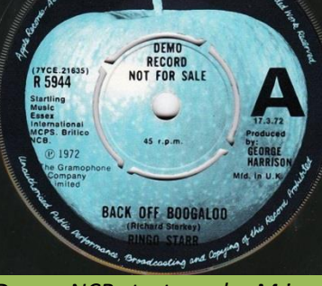
Demo, NCB starts under M in MCPS