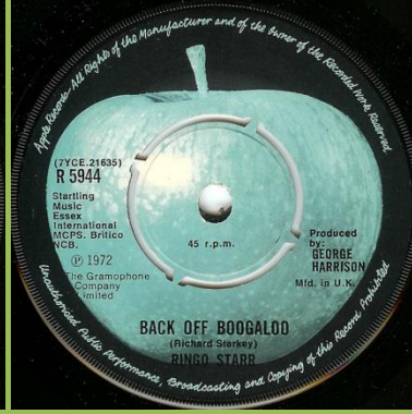
@ starts under . in NCB.