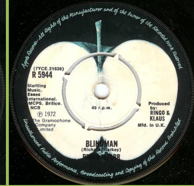
Produced aligned left