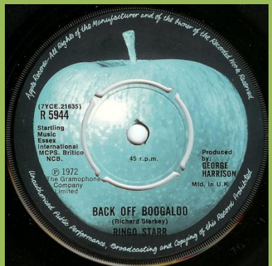
R 5944 starts under 7 in (7YCE, @ starts under C in NCB, more space over and less space under @1972