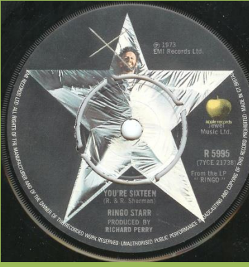
A in apple starts over u in Music A in apple starts over R in Ltd., R 5995 starts under u in Music Ltd.