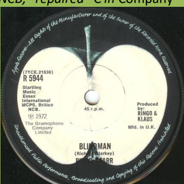
R starts over spacing between "S" and "t" in Startling