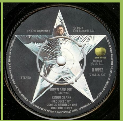
Large polo ring on B-side,