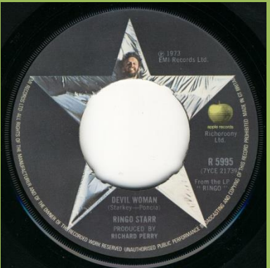
A in apple starts over spacing between R and i in Richoroony, R 5995 starts under i in Richeroony