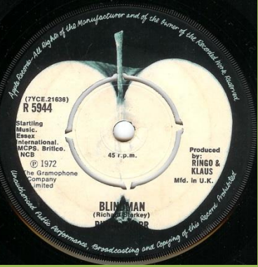
Produced aligned left, small polo ring on B-side