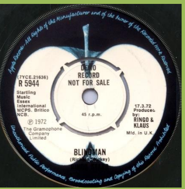
Demo, NCB starts after C in MCPS