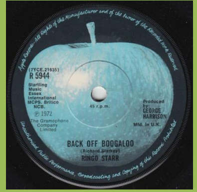
(7YCE starts before R, R starts over St in Startling, NCB starts under spacing between C & P in MCPS, Ø starts under N in NCB