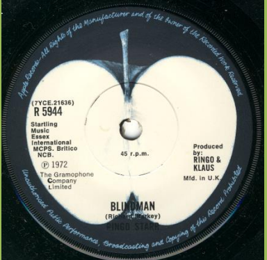
(7YCE starts before R, MCPS starts under n, NCB starts under spacing between M and C, Produced by: Ringo & Klaus aligned, @ starts under C in NCB, "repaired" C in Company

(7YCE) starts before R, NCB starts under spacing between C and P in MCPS, ® starts under C in NCB