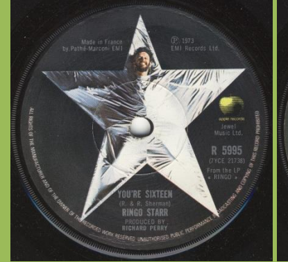
Contract pressing Made in France