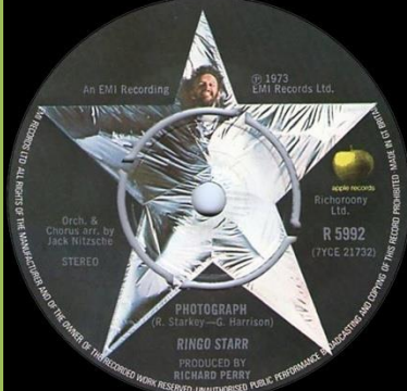
With Stereo on A-side only