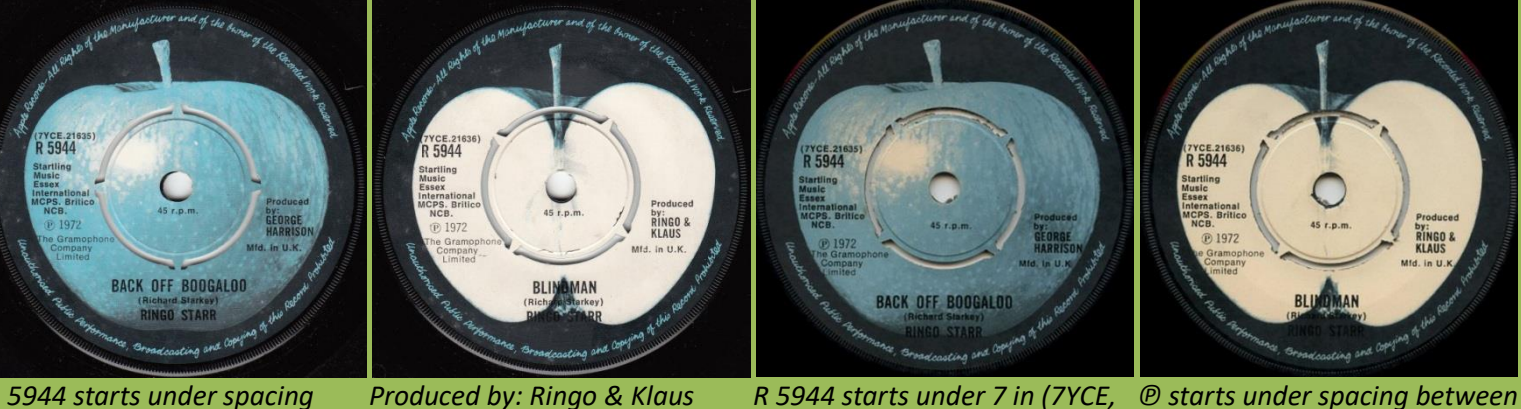
R 5944 starts under spacing between ( and 7 in (7YCE , @ starts under N in NCB and over e in The