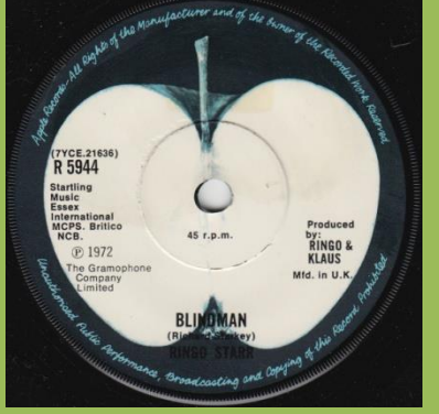
International aligned left of MCPS, NCB starts under spacing between M & C in MCPS

(7YCE starts before R, R starts over 1st t in Startling, NCB starts under spacing between M & C in MCPS, @ starts under spacing between N & C in NCB