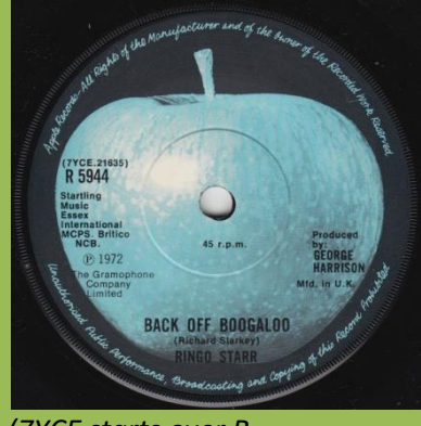
(7YCE starts over R, R starts over 1st t in Startling, NCB starts under P in MCPS, @ starts under C in NCB