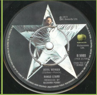
Richoroony, R 5995 starts under R in Richoroony