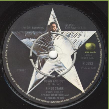
Small polo ring on B-side