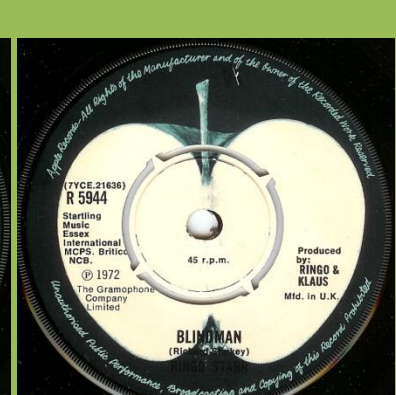
R 5944 starts under 7 in (7YCE, Produced aligned right of by