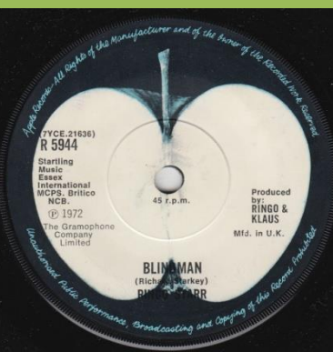
International aligned left of MCPS, NCB starts under spacing between C & P in MCPS