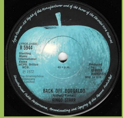
No space over Mfd. in U.K., International Essex misprint