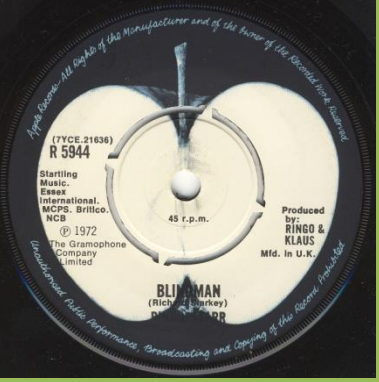
Produced aligned left, large polo ring on B-side