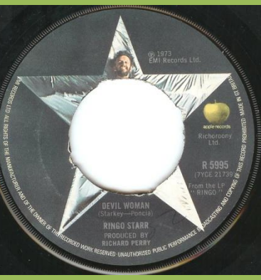
A in apple starts over c in Richoroony, R 5995 starts under i in Richeroony