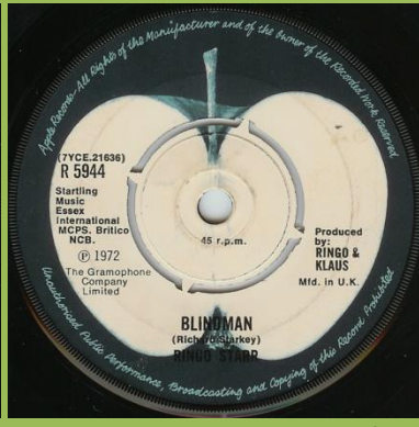
Publishing credits aligned left, polo rings