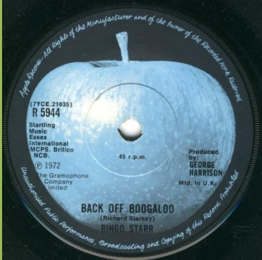
(7YCE) starts before R, NCB starts under spacing between C and P in MCPS. ® starts under spacing between N and C in NCB