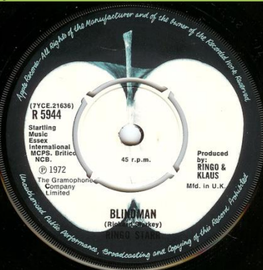
@ starts under C in NCB, "repaired" C in Company