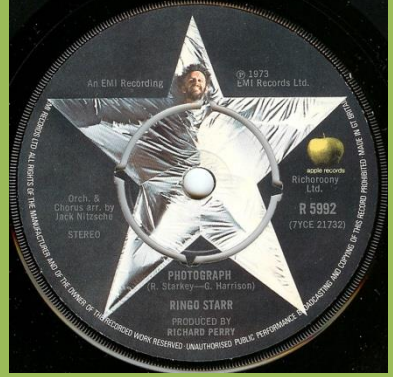
With Stereo on both sides, A in apple starts over h in Richoroony