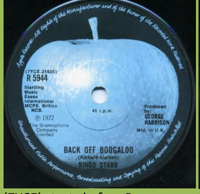
(7YCE) starts before R, NCB starts under spacing between C and P in MCPS, ® starts under C in NCB