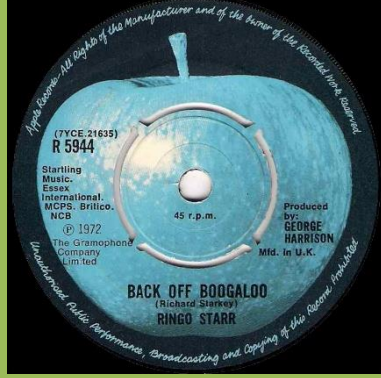
R 5944 starts under ( in (7YCE, @ starts under B in NCB, Mfd. in U.K. starts over last O in BOOGALOO