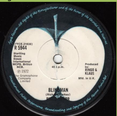
International & MCPS not aligned, NCB starts under P in MCPS