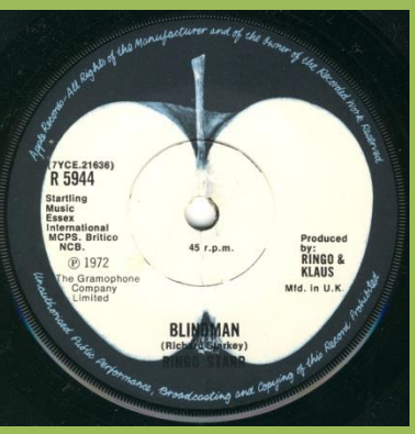
(7YCE starts before R, MCPS starts under n, NCB starts under C, Produced by: Ringo & Klaus aligned