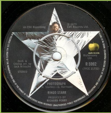
With Stereo on both sides, A in apple starts after h in Richoroony