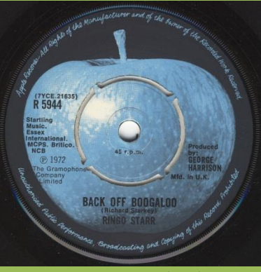
R 5944 starts under ( in (7YCE, @ starts under B in NCB, Mfd. in U.K. starts over last O in BOOGALOO