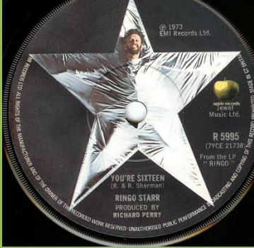
A in apple starts over R in R in Richoroony