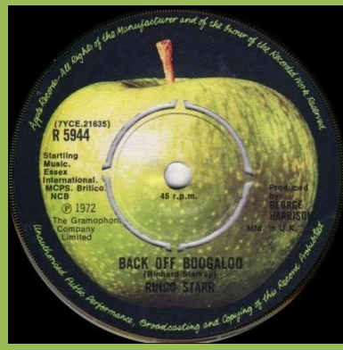
Later issue with green Apple labels