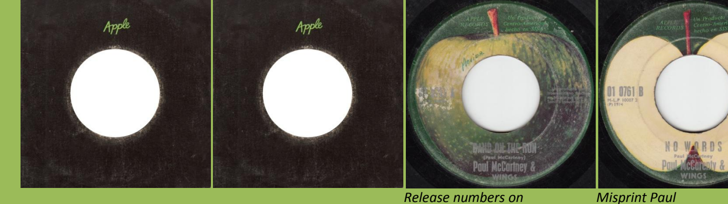
left side of labels