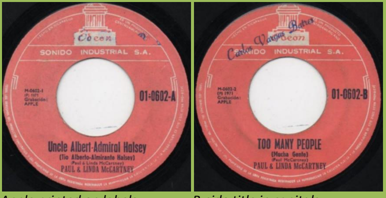
Apple printed on labels