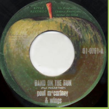
Release numbers on right side of labels without M-10007-1 and (p) 1974 print underneath