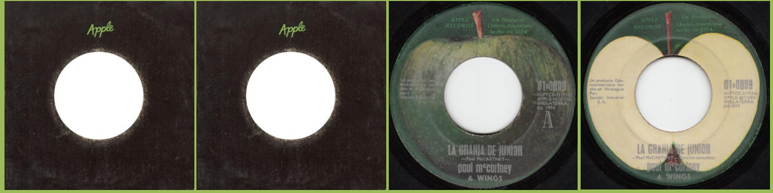
Possibly a promo release, no promo markings on the labels, however