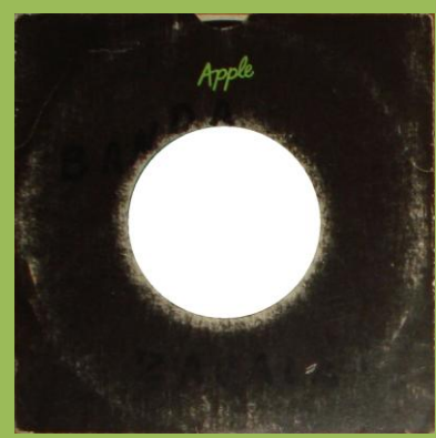
Company cover with thumb tab on top