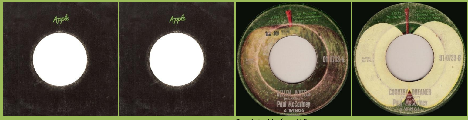
& printed before Wings

APPLE 01-0733 - HELEN WHEELS / COUNTRY DREAMER