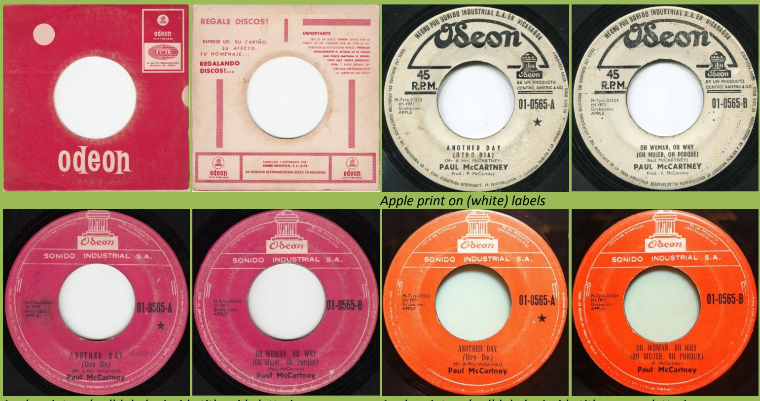
Apple print on (red) labels, A-side title wide lettering, B-side subtitle in underscores

Apple print on (red) labels, A-side title narrow lettering, B-side subtitle in capitals