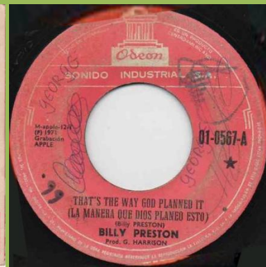
Apple print on labels