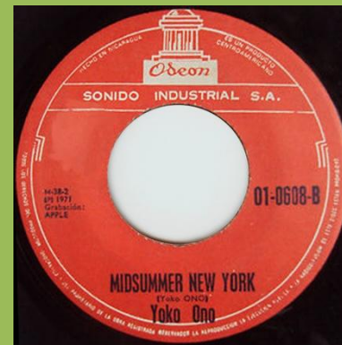
Apple print on labels