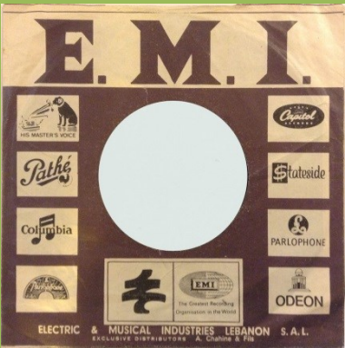
Singles can be found in various company covers (with APPLE logo or APPLE print and without logo or print)