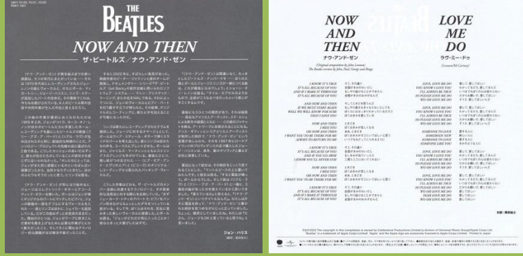
Japanese 2-sided lyric sheet