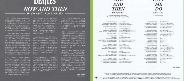
Japanese 2-sided lyric sheet