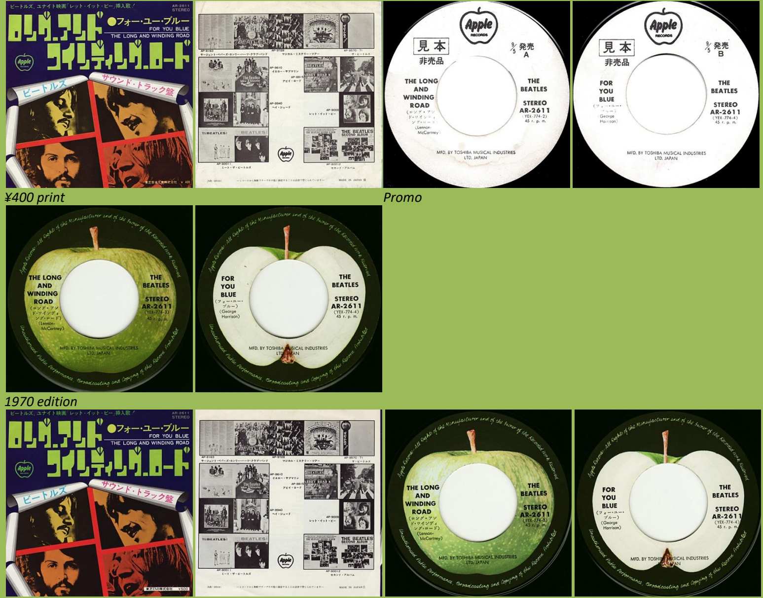
¥500 print, EMI cover

APPLE AR-2611 - THE LONG AND WINDING ROAD / FOR YOU BLUE