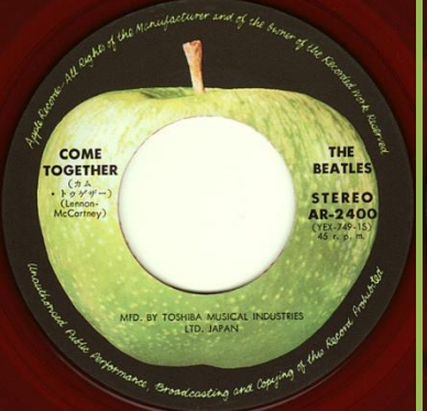
1973 red vinyl edition