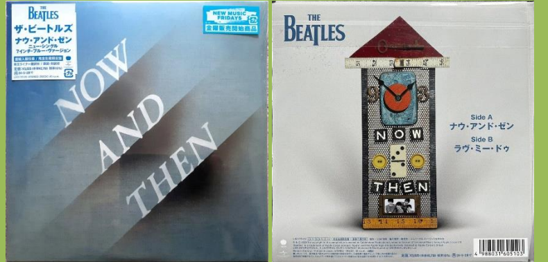
Plastic bag with sticker and Japanese rear insert

Record made in EU, re-packaged with Japanese sticker, rear insert and lyric sheet, for other contents see EU-section