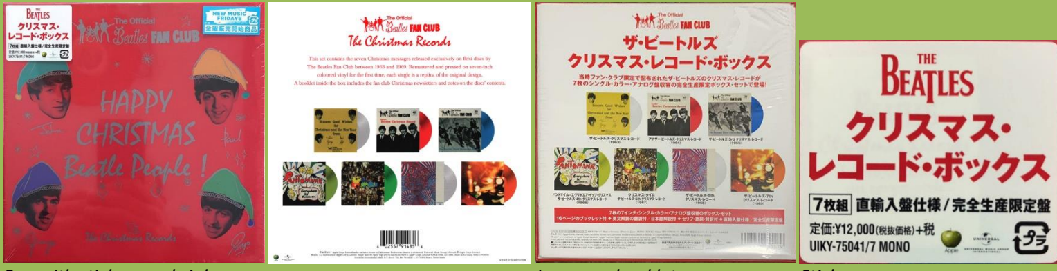
Box with sticker on shrink