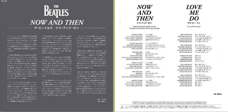
Japanese 2-sided lyric sheet (same as with the 10" version)