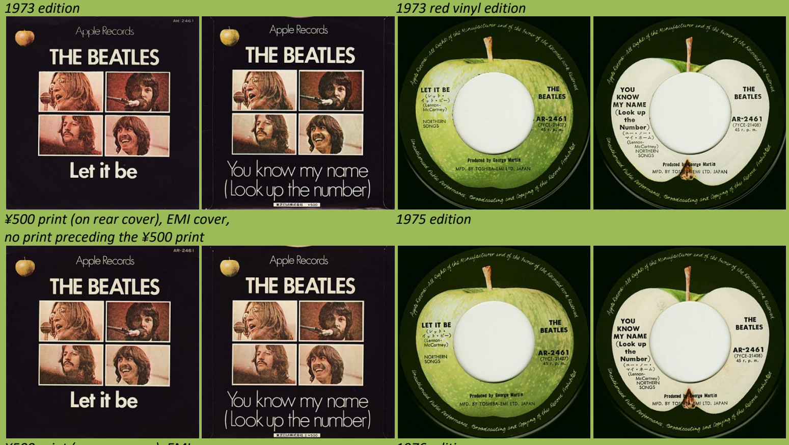
¥500 print (on rear cover), EMI cover, I (in circle) precedes ¥500 print