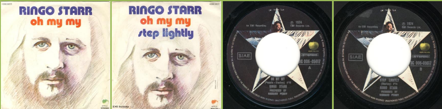
Small spacing between Apple Records and Stereo print