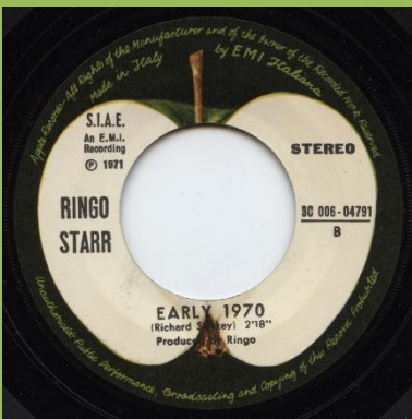
RINGO STARR on left