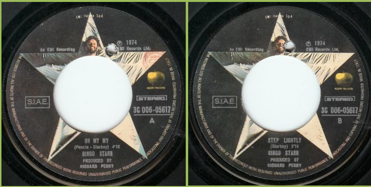
Large spacing between Apple Records and Stereo print