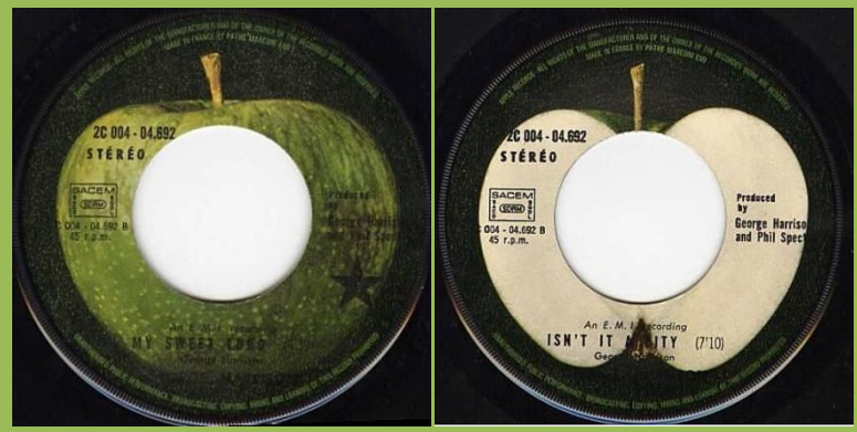
2C 004 numbers, printed perimeter