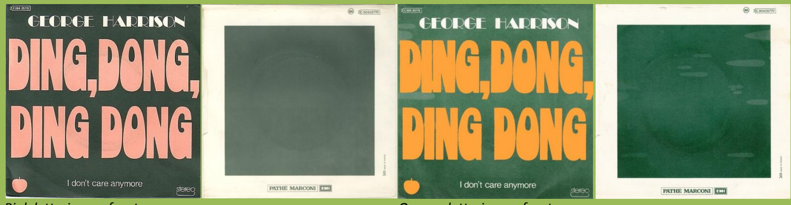
Pink lettering on front