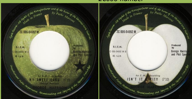
2C 006 numbers, No EMI print on labels