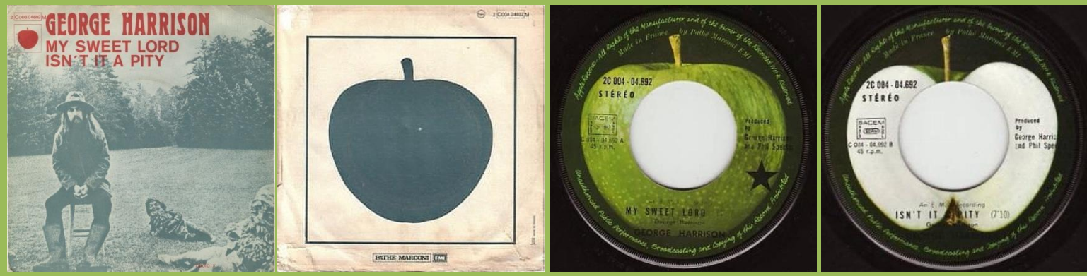
Large Apple logo on back