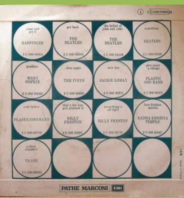
With boxed EMI logo, letter J preceding 2C006-number