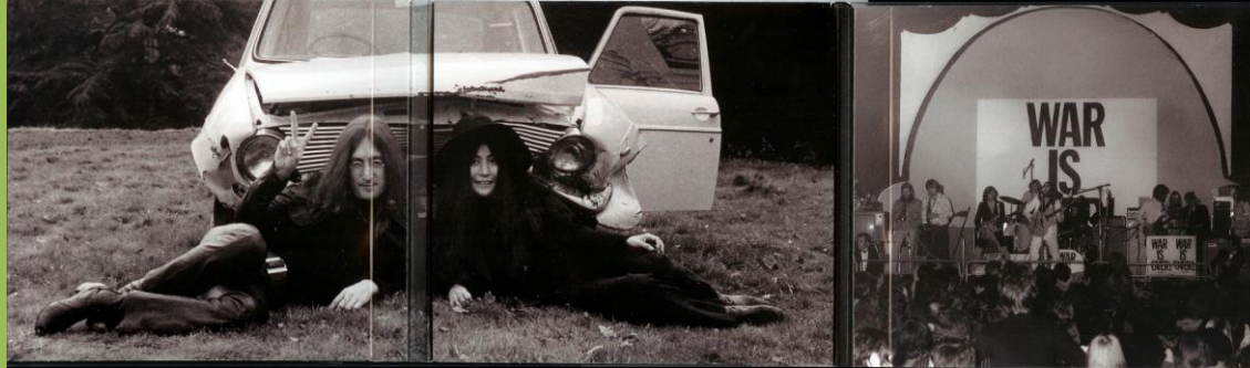
Small Apple on backcover