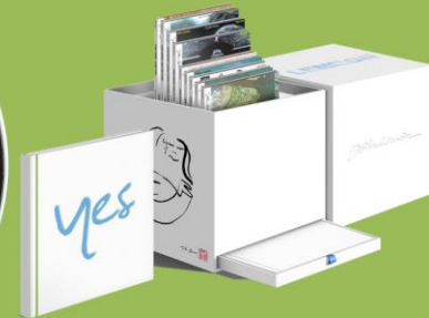
Disc came also as part of the LENNON SIGNATURE BOX, box is made in USA